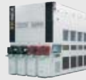
Wafer wet cleaning equipment