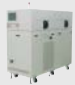
Processing systems for solar cells