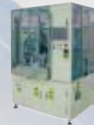
Vacuum bonding equipment